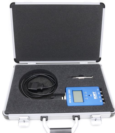
RPM8000OBDD2 – in transport case